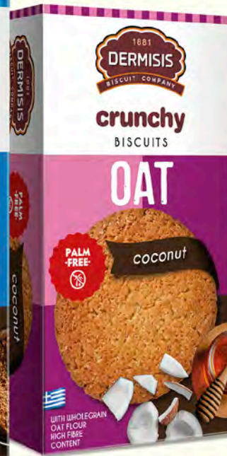
ref.: 0301004 160g OAT CRUNCHY COCONUT