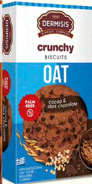
ref.: 0301002 160g OAT CRUNCHY BISCUITS WITH COCOA AND DARK CHOCOLATE