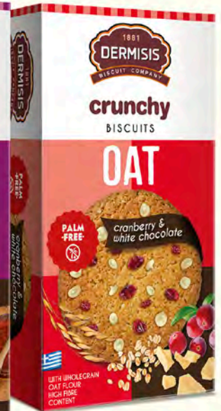
ref.: 0301001 160g OAT CRUNCHY CRANBERRY