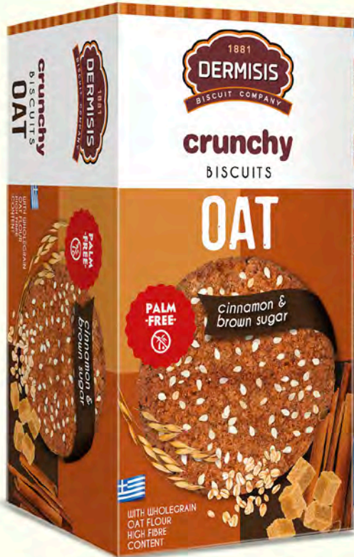
ref.: 0301003 180g OAT CRUNCHY BISCUITS WITH CINNAMON AND BROWN SUGAR